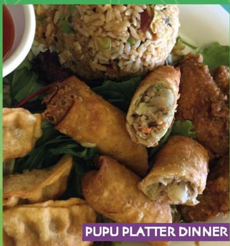
PUPU PLATTER DINNER