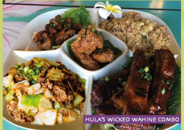
HULA'S WICKED WAHINE COMBO

A GENEROUS PORTION OF HULA RIBS, TERIYAKI CHICKEN, KALUA PORK & CABBAGE, 4 MAUI WOWIE WINGS, FRIED RICE, POTATO SALAD & SLAW.... FEEDS 2 OR MORE AND STILL MAY HAVE ENOUGH TO TAKE LEFTOVERS HOME.