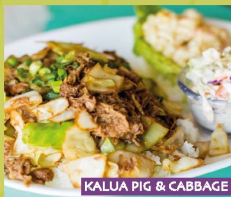
KALUA PIG & CABBAGE

VOTED THE BEST WINGS IN TOWN AND ACCLAIMED BY MANY THE BEST THEY'VE EVER HAD, OUR WINGS ARE FRIED AND SERVED WITH A CHOICE OF A "MILD" OR "LAVA HOT" SAUCES MADE WITH THE COMBINATION OF HAWAIIAN, CHINESE, JAPANESE AND KOREAN SPICES.