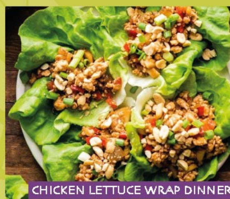
CHICKEN LETTUCE WRAP DINNER