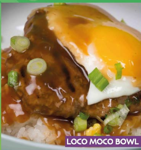
LOCO MOCO BOWL