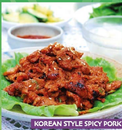
KOREAN STYLE SPICY PORK