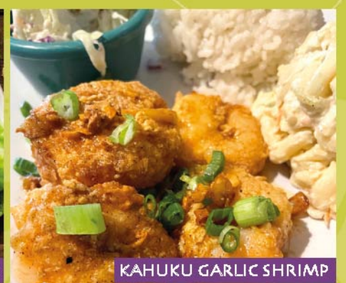
KAHUKU GARLIC SHRIMP

WITH YOUR CHOICE OF SLAW OR POTATO SALAD. | OUR SIGNATURE FRIED RICE MAY BE SUBSTITUTED FOR WHITE RICE: ADD 4.99