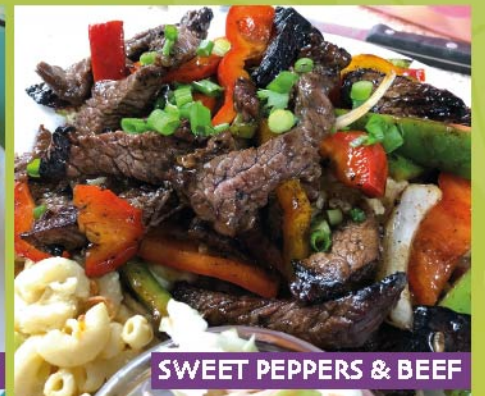
SWEET PEPPERS & BEEF